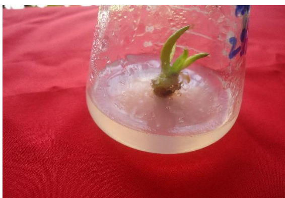
Figure 1 : Shoot Initiation from Shoot tip Explant of Jackfruit

This finding differed with present finding as the highest number of multiple shoots produced in this investigation in the medium supplemented with 4.0 mg -1 BAP. Actually more success obtain from woody species like jackfruit is difficult due to different contaminations, phenolic compound formation, vitrification etc.